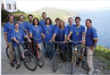
Best wishes FREE SPIRIT 2009

We hope you will be able to enjoy these few days on Beara with us.