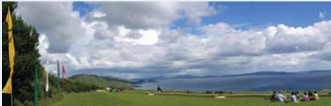
The meditation garden at Dzogchen Beara

FREE SPIRIT is alcohol & drug free Thank you!